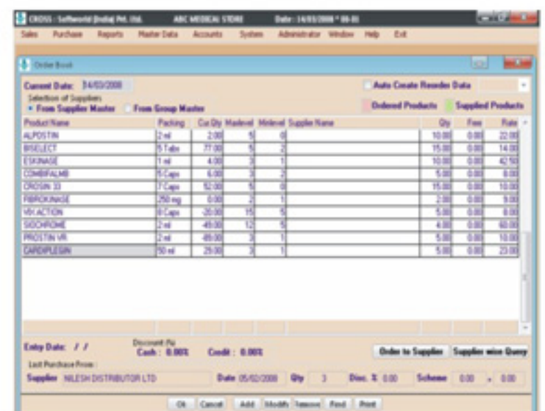
Effective Ordering System