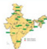
All India Network