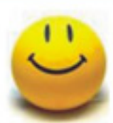
10000 Satisfied Clients