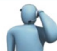
Customer Care Centre