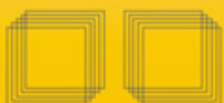
Easy to Use Solutions

© Copy Right 1991-2008 SWIL. Unisolve, Cross & Retailgraph are registered trade marks of SWIL. All other trademarks acknowledged.